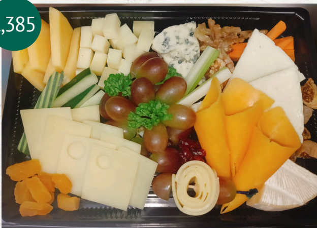
Cheese Platter with Crackers

All prices are listed in peso and inclusive of government taxes and service charge.