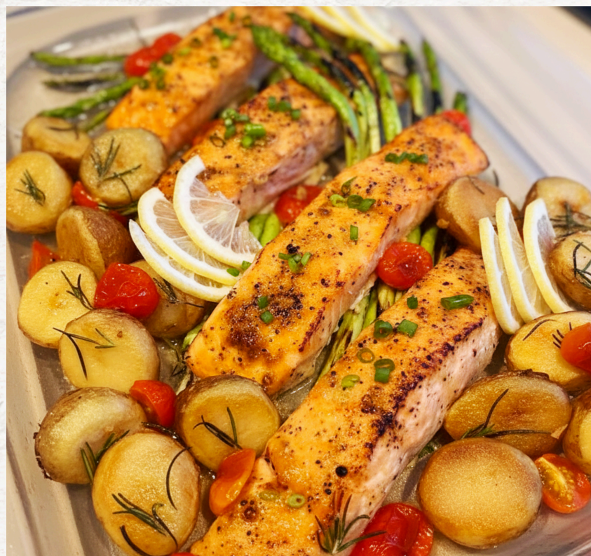
The image illustrates a serving for 4 persons.