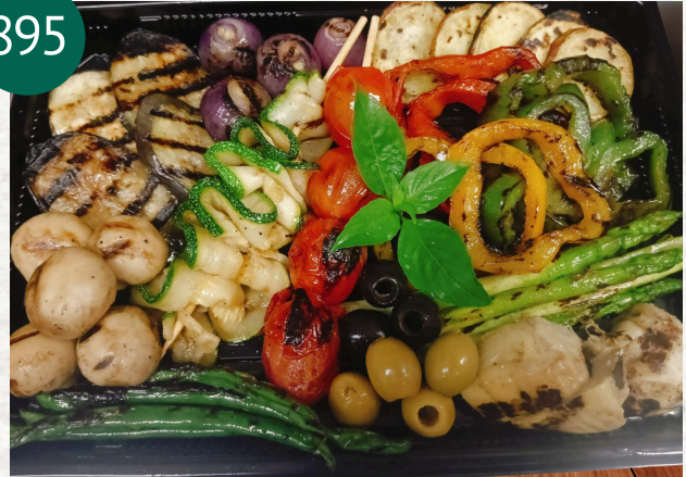
Grilled Vegetable Platter