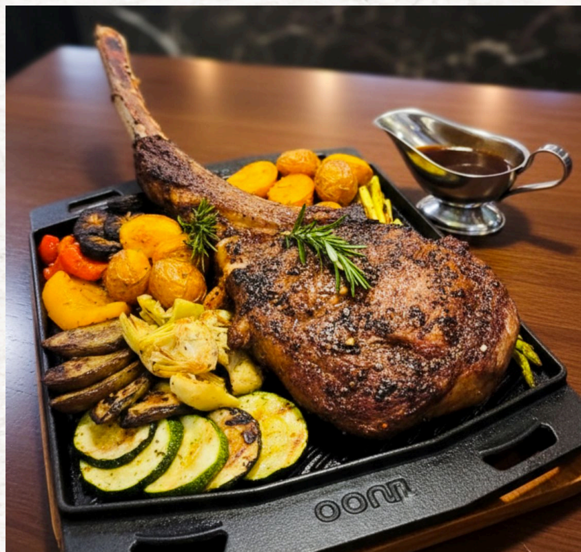
1.8 kg. Tomahawk Steak