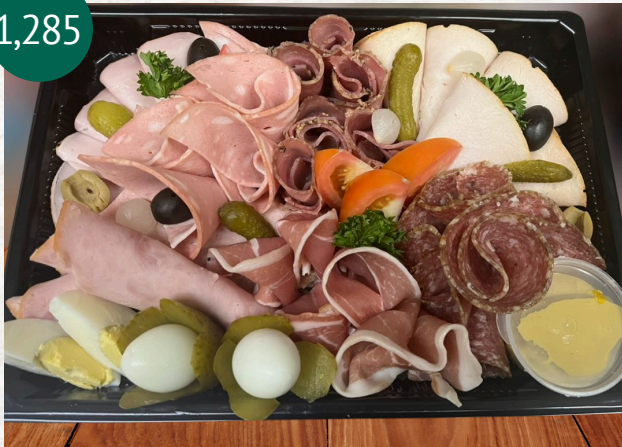
Cold Meat Platter with Bread